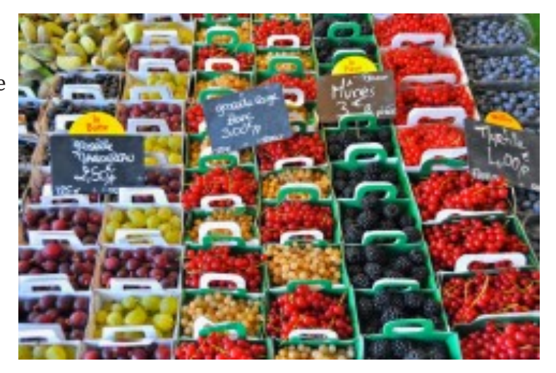
EBT, cash, and credit cards accepted!